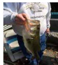
5 lb. 19" Bass caught by