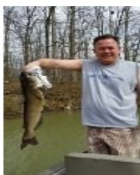
8 lb. 28 " catfish caught on 2 lb. line by